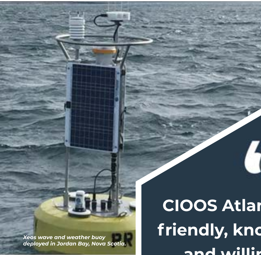
Xeos wave and weather buoy deployed in Jordan Bay, Nova Scotia.

Xeos buoys with streaming capabilities for wave and weather data are currently deployed in Jordan Bay, St. Mary's Bay and Chedabucto Bay. Data from these buoys is streamed to CIOOS every 30 minutes, including wave direction and spread, significant wave height, maximum wave height, peak wave period and wave spread. Extreme wind and wave condition values are used to validate robust exposure models for bays throughout Nova Scotia, to inform decisions on existing and potential aquaculture sites.